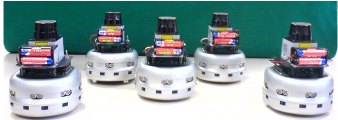
Fig. 1. A team of five Khepera robots. Each robot has an on-board Hokuyo range-finder and associated battery pack.

A more difficult problem is to simultaneously estimate the odometry parameters plus some other sensor parameters. A